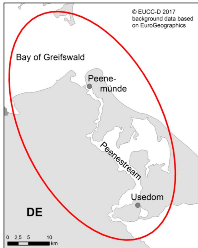
Fig. 2: Case study site Peenemünde, Germany

Location of study site: Peenemünde is a community on the island of Usedom in Mecklenburg-Western Pomerania, north-east of Germany. The peninsula Peenemünde is located in the east of the bay of Greifswald, which is a border water of the Baltic Sea. The maximum depth of the bay surrounding Peenemünde is 8 to 10 meters. The border areas range from 0,5 to 5 meter depth. These shallow areas often lie dry, depending on the wind conditions. The average salinity of the bay of Greifswald lies at about 6 to 7 psu. The Peenestream flows into the bay of Greifswald. Thus, the water balance is determined by the Baltic Sea exchange and the inlet of freshwater rivers flowing into the Peenestream. In the Peenestream the salinity declines further south.